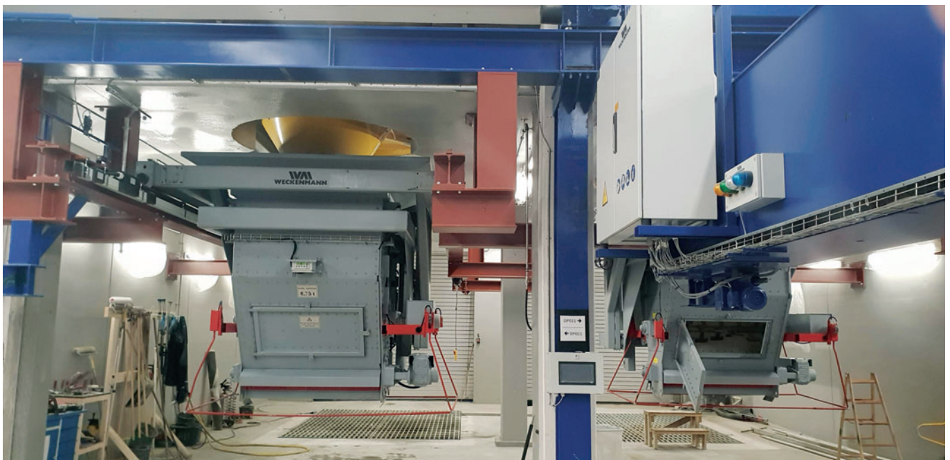
Concrete distributor with two buckets

Weckenmann Anlagentechnik GmbH+Co.KG Birkenstraße 1 72358 Dormettingen, Germany T +49 7427 94930 F +49 7427 949329 info@weckenmann.de www.weckenmann.com