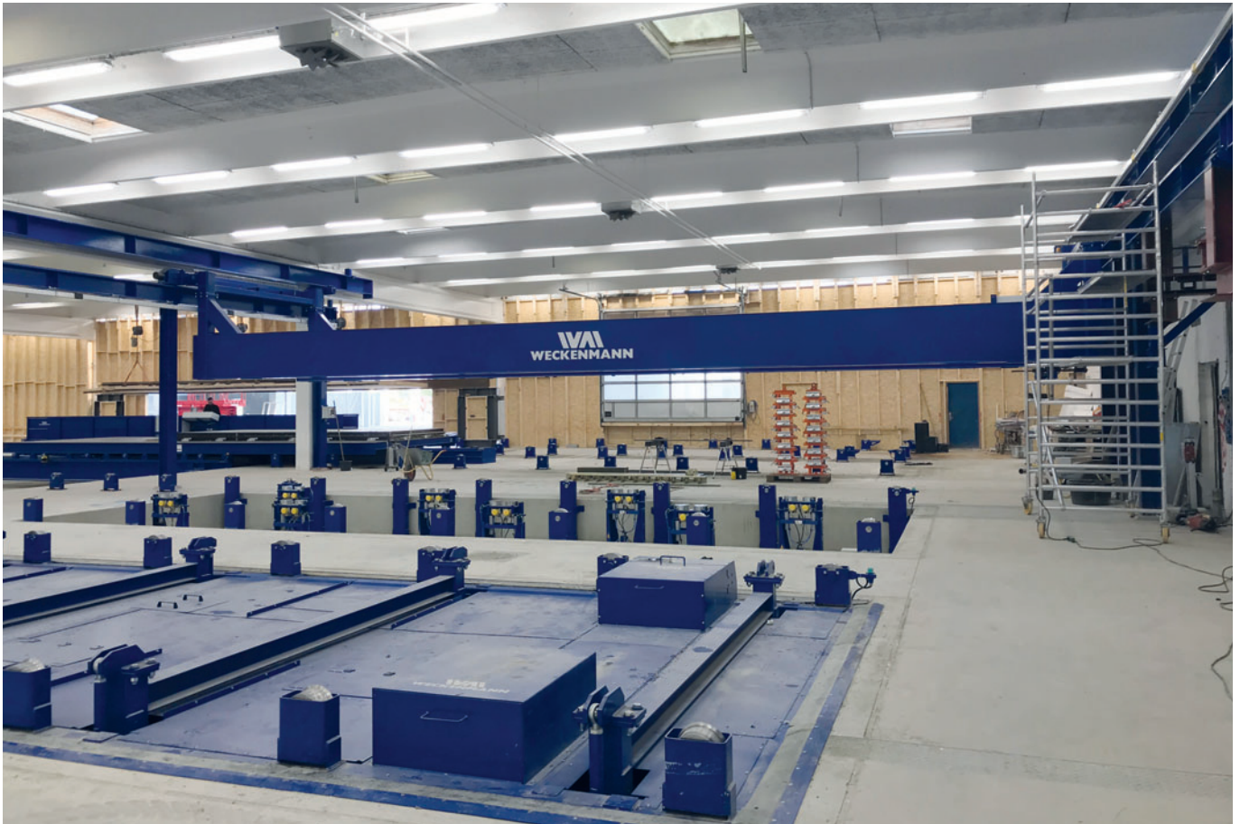
Weckenmann vibrating station and MagVib vibration technology

ets was installed in the precast plant, enabling the use of different sorts of concrete such as grey and coloured concrete. The power trowel employed ensures a high surface quality of the precast concrete elements produced. A large range of