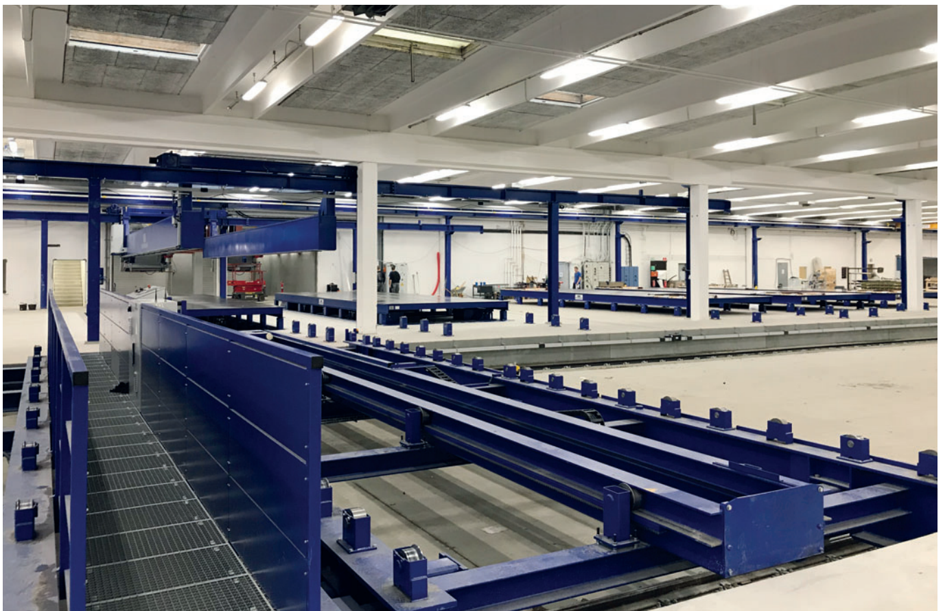
Central transfer table with double platform

As a further advantage the transfer table has two platforms and can therefore transport two pallets at the same time. This has a positive effect on the utilisation planning and the fast conveying of the pallets. A concrete distributor with two buck-